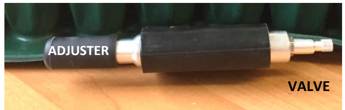
ADJUSTER IS OPEN

Attach the pump tube onto the cushion valve. Open the adjuster and the valve by turning. Inflate the cushion. Close the valve by turning it clockwise. Now, the adjuster is still open and the air can float between all cells and chamber.