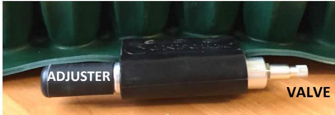
ADJUSTER IS CLOSED

Open the adjuster and the valve (the cushion can only be inflated, when both are open)